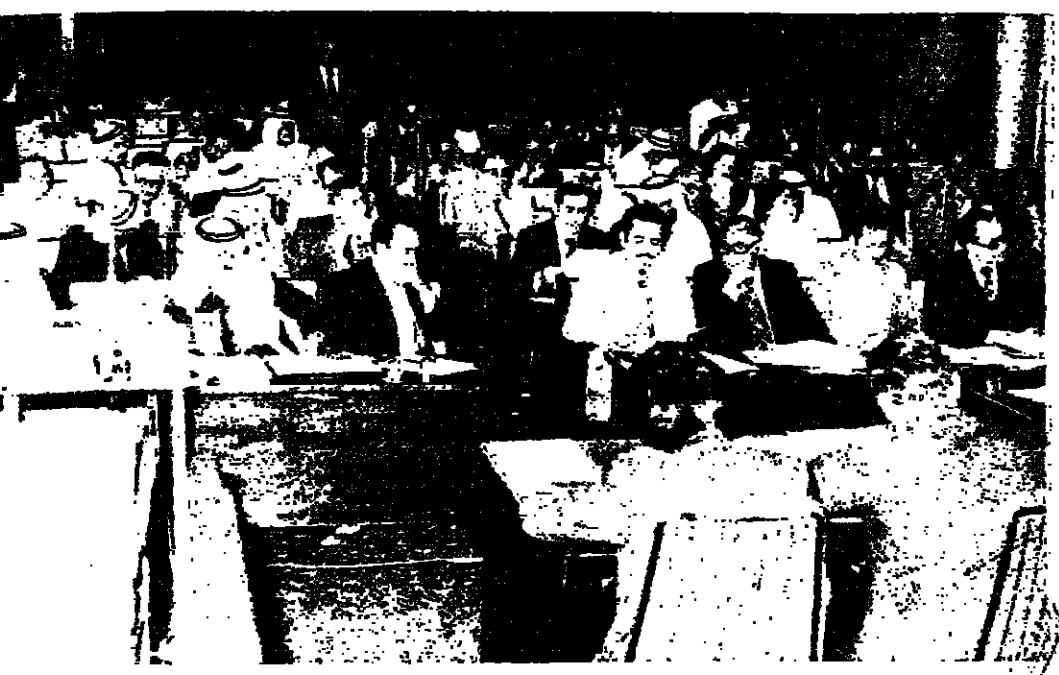
Members endorse the government's determination to keep UNRWA schools open.

Yesterday's high temperatures: Amman 30, Aqaba 39. Sunset tonight: 6:11 p.m. Sunrise tomorrow: 4:58 a.m.